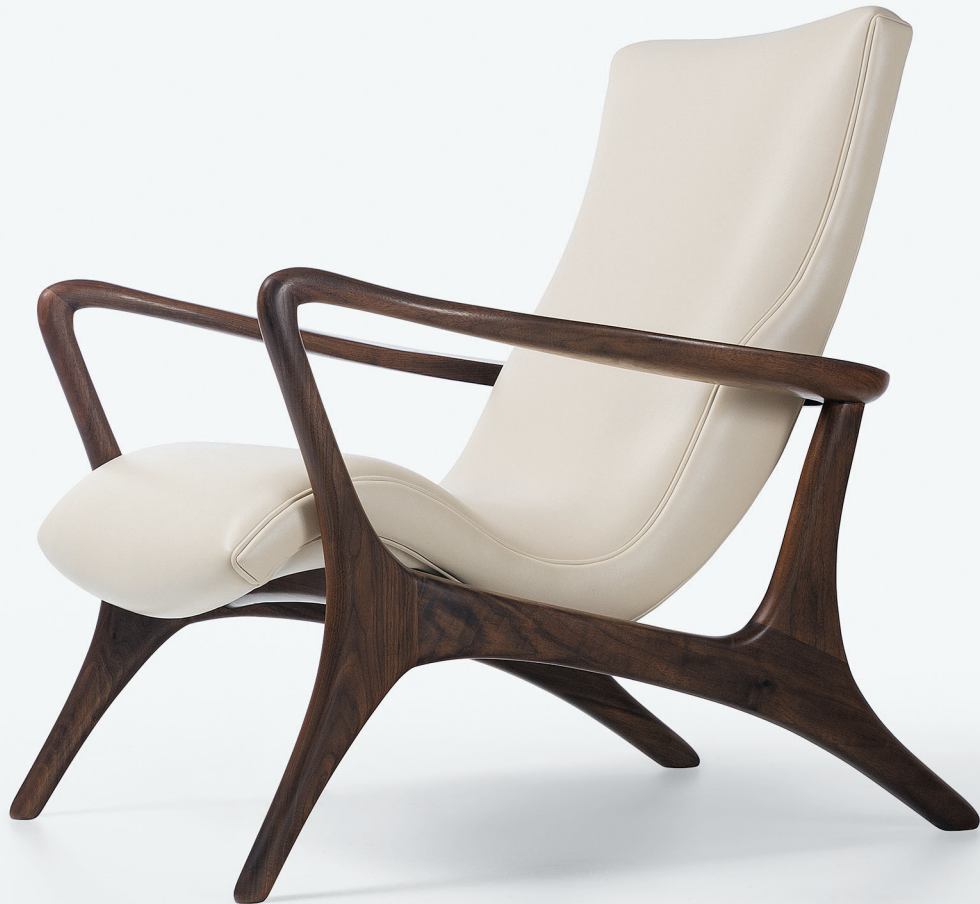
Contour Low Back Lounge Chair Model - 175E | Designed 1953